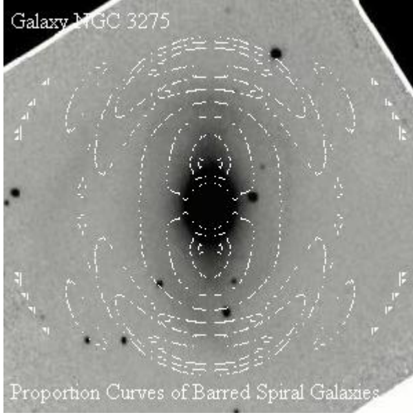
Figure 4: The longer-wavelength image of barred spiral galaxy NGC 3275 as shown on Figure 2. The spider-shaped proportion curves do trace or cut through arms or rings consistently as in the case of normal spiral galaxies (see Figure 1).

indicated by the formulas (3) and (4), it is unlikely that the proportion curves of barred spiral galaxies could be expressed with analytical formulas too. The calculation of the azimuthal angle \alpha for the tangential lines of proportion curves involves the third derivatives of f(x, y) while the calculation of the rational orthogonal conditions involves the fourth derivatives. Without further theoretical analysis and appropriate computing technique, the numerical calculation with common computers may present significant errors. Fortunately, the error can be greatly reduced by the choice of larger scale s in the formula (7). The choice of the scale in Table 1 (the third column) indicates that the left sides of the orthogonal conditions (13) and (15) (i.e., P(x, y) and G(x, y) ) are significantly small in the relevant areas for the galaxy NGC 3275. That is, the absolute values of these quantities are less than 10^{-16} . This suggests that the galaxy is rational. Detailed calculation indicates that there are a few lined areas where the discriminant of the quadratic equation (11) is negative. This means that the galaxy must be at the ground state in the relevant areas. In all other areas, the absolute values of P(x, y) are much smaller than the ones of the quantities M(x, y) and G(x, y) . It means that the galaxy is generally at the excited plus state.