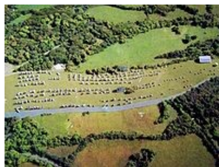
stone alignments at Carnac, Brittany

Stone Alignments and Circle Formations: We believe that the mystery of Stonehenge is intimately linked to the many stone alignments and circle formations to be found in many other places in Europe and indeed of the world. We consider the physical features of these stone formations that can be directly observed on site. We examine such stone alignments in the Brittany area of France, closest geologically and geographically to Stonehenge. These stone alignments, for example in Carnac, Brittany, are nearly straight lines and parallel (with some deviations at places). The spacing between rows is nearly uniform and equal.