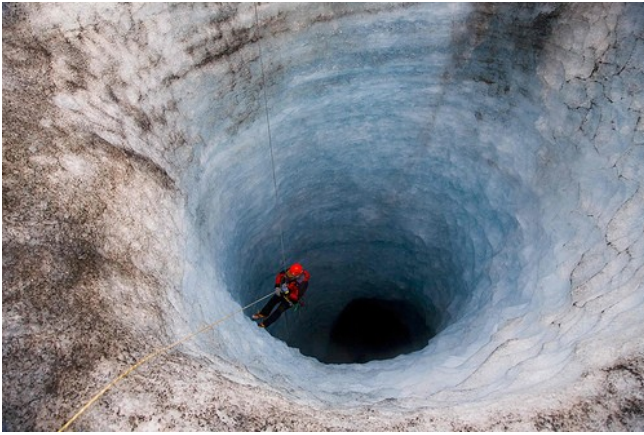
Iceland, glacier hole