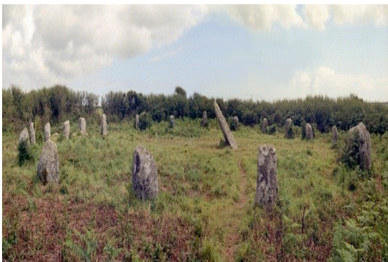
Boscawen-un Circle, Cornwall, UK

Avebury is the largest stone circle in the world: it is 427m (1401ft) in diameter covers an area of some 28 acres (11.5 ha). ... a huge circular bank (a mile round), a massive ditch now only a half its original depth, and a great ring of 98 sarsen slabs enclosing two smaller circles of 30 stones each and other settings and arrangements of stones. The outer bank, still very impressive, was originally 17m (55ft) high from ditch bottom to bank top. The stones, each weighing about 40 tons or more,