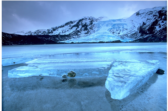
Iceland, glacier edge with boulders

There are geothermal springs and hot spots throughout the surface of the Earth. These spots can be found in greater number at regions of greater volcanic and seismic activity. The British Isles and North Western Europe were experiencing great geological evolution that extended into the Ice Age, (somewhat similar to Iceland now, with ice glaciers and volcanoes simultaneously existing). Places like Bath, UK (some 25 miles West of Stonehenge) have the warmest hot springs in all of Europe. At such hot spots the ice sheet will melt more quickly, forming an ever expanding circular area. Or such melting sink holes may have been formed by irregularities in the ice and more rapid melting due to the land and glacier morphology and melting process. Thus, at places where melting first begins will show more accelerated melting. Such areas will expand radially and evenly creating concentric rings if the edge was to be traced.