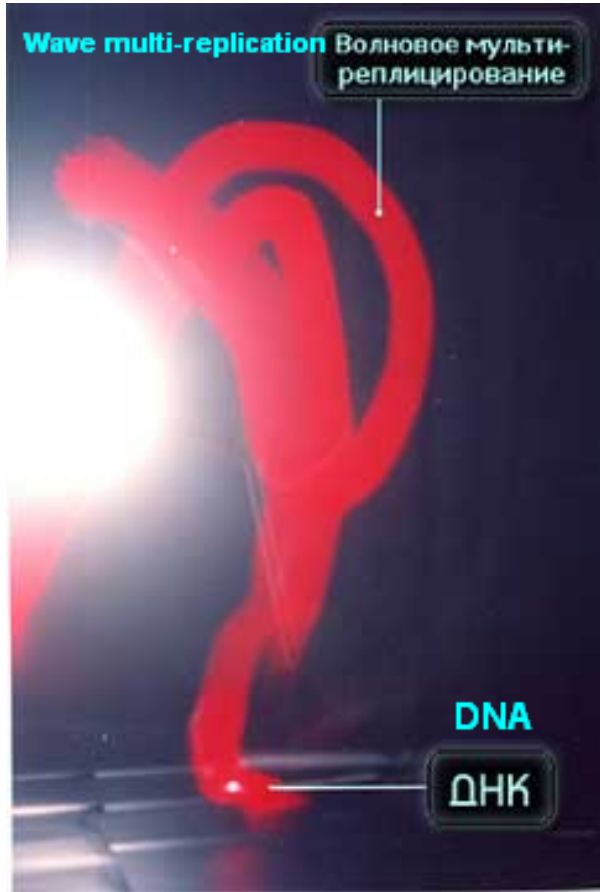
Figure 3: The picture reveals the 5-fold fine structure of the band like image interpreted by experimenters as replica image of DNA sample. The 5-fold character probably correspond to five red LEDs above the sample (second method).

macroscopic quantum coherence suggesting a large value of Planck constant. If the coherence is required at least in the length scale L of the flux tube, one obtains ratio r = \hbar/\hbar_0 \geq L/\lambda \simeq 10^6 for L = .5\text{m} and \lambda = 500 \text{ nm} . This value could correspond to the favored value r = 2^{20} and thus to a favored value of Planck constant [24]. A weaker condition is obtained by replacing L with the size a of the cell giving r \geq a/\lambda \simeq 2 \times 10^5 for a = .1 \text{ m} .